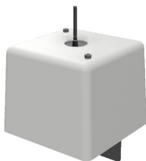
Standard version (Praxis/OPCube)