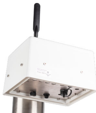
Pro version (Praxis/Urban)